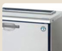
Table Top Opening