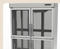
Window Glass Door