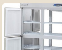
Pass Through Doors