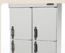
All Left / Right Hinge Door